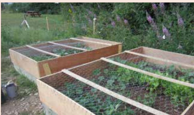
Employee garden allotments at Atlas Box