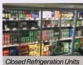
Closed Refrigeration Units