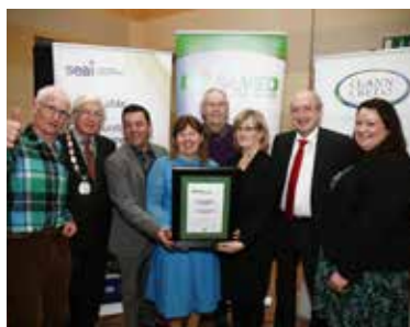
Boomerang Enterprises was acknowledged at the Awards for the Get Involved Sustainable Communities Initiative. The main sponsor of Get Involved is the Sustainable Energy Authority of Ireland (SEAI)