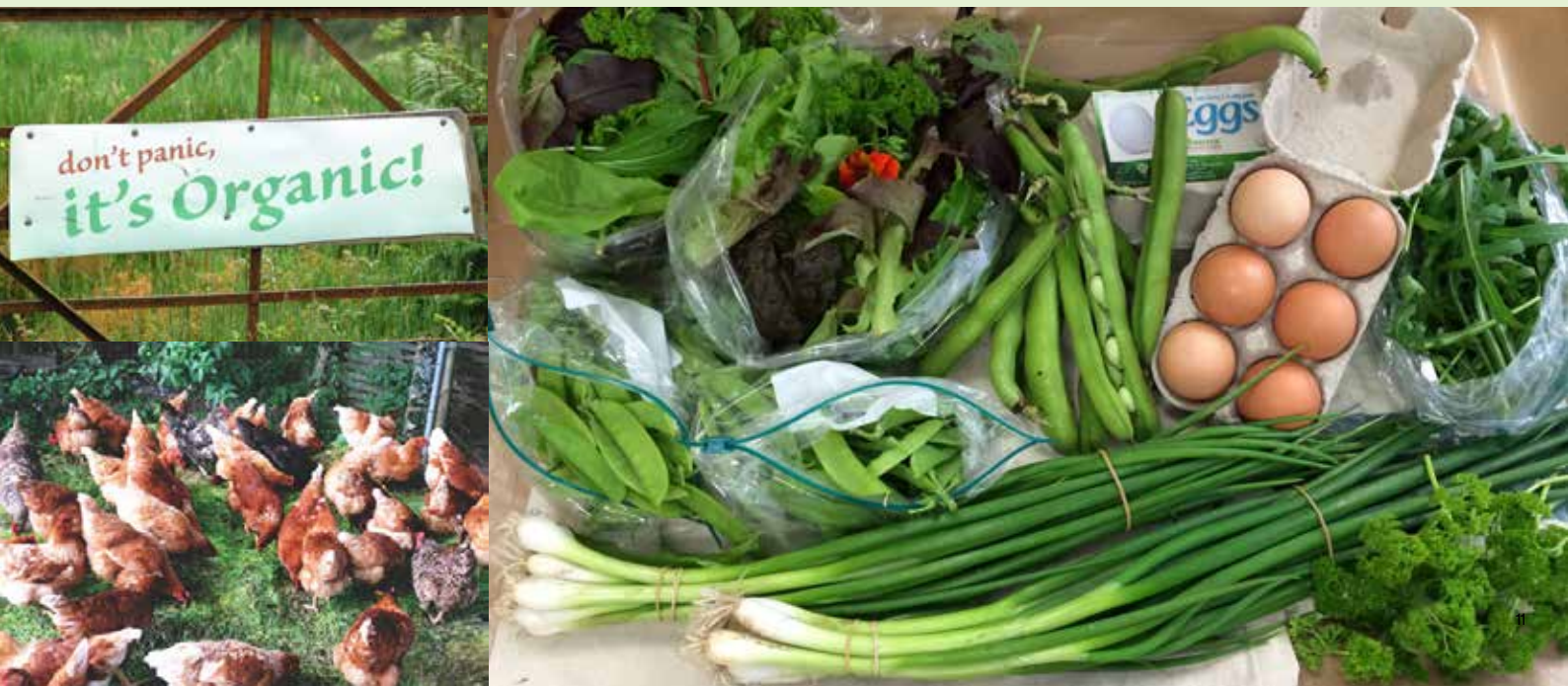
Manna Organic Produce