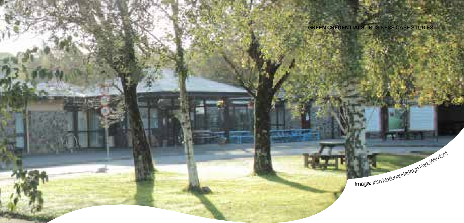
Image: Irish National Heritage Park Wexford